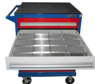
Push Bar with Swivel Casters