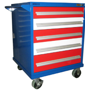
Custom Painted Mobile Cabinet